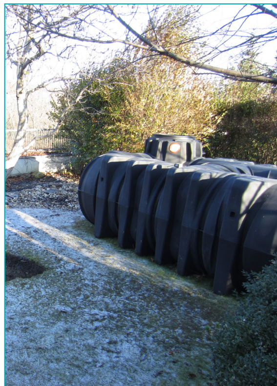
A rainwater harvesting tank before being buried in the soil

The subsidy is financed from the municipal budget of the city of Bratislava. The amount of the total allocation was €50,000 in 2016 and was reconducted in 2017 with a total of €40,000. This sum is to be distributed among approximately 40 to 50 applicants. The subsidy always covers 50% of total costs of the installations, up to a maximum amount of €1,000 per application. In addition to the scheme, applicants also receive consultancy on their project's implementation and dissemination provided by the city of Bratislava.